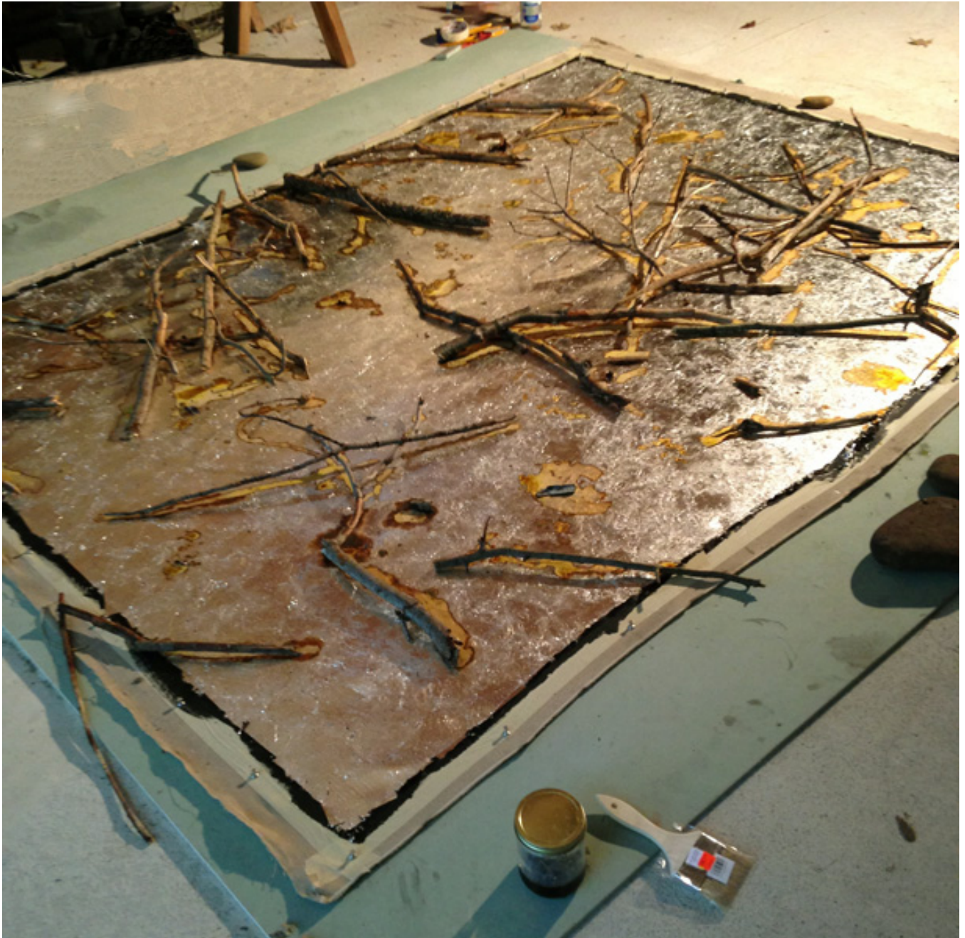
Contingency [Sticks & Stones] , 2013 in the Pennsylvania studio: the sticks had been gathered for kindling, but before being thrown into the fire were randomly tossed onto the linen in order to make a chance-based composition. (Detail opposite)