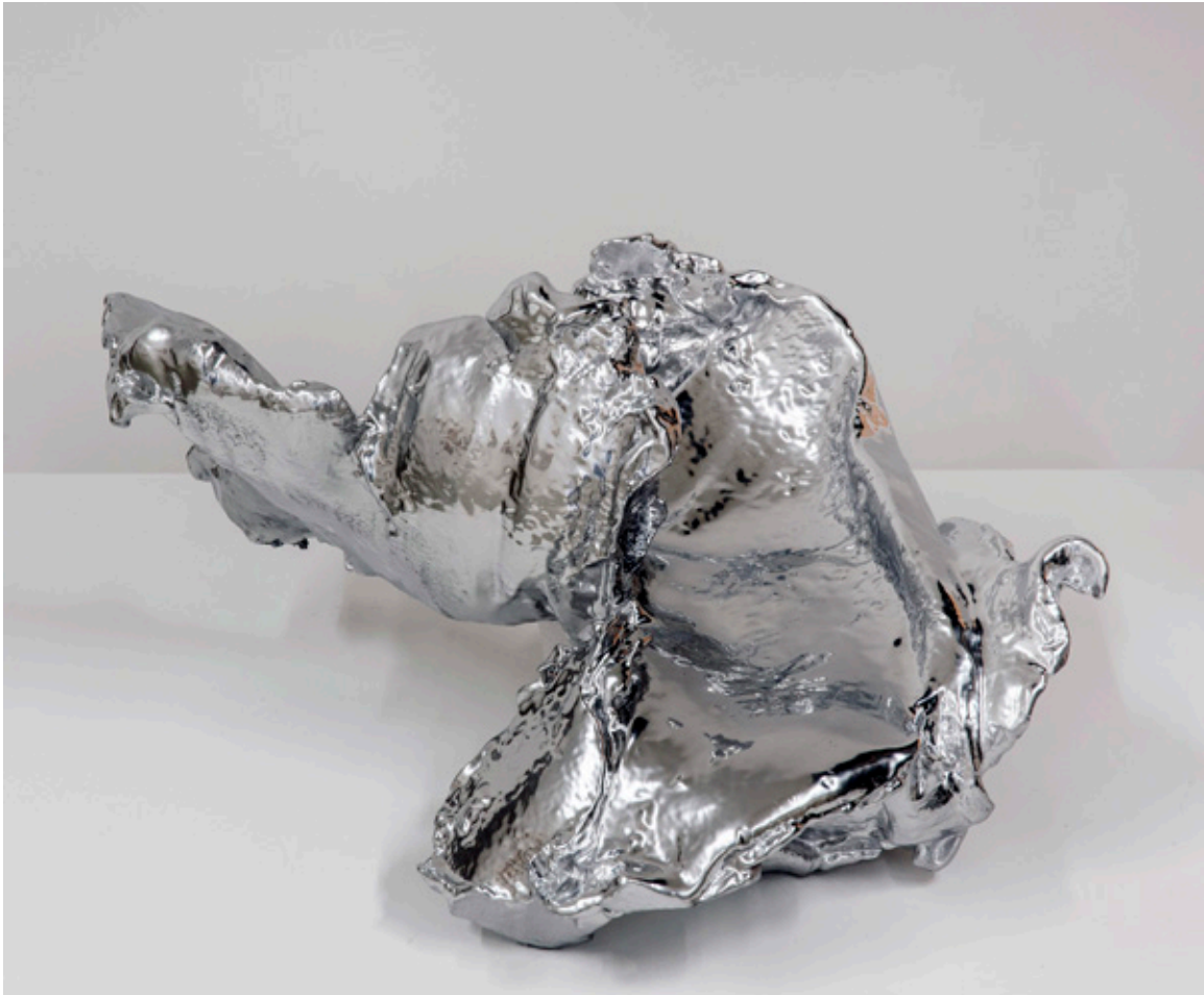
Spent Bullet [Aluminum I] , 2015/2016 Edition of 2, ABS resin, aluminum paint 9 ½ x 20 x 16 ½ inches Edition Number 1: Judith Pizar, New York