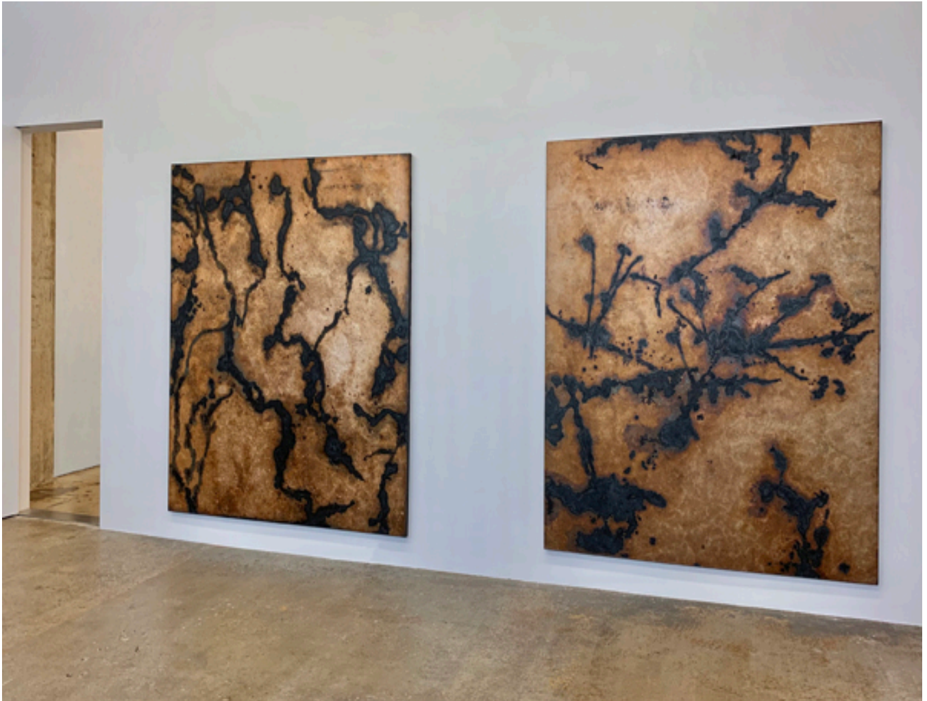
Contingency [Riverroots], 2012 Contingency [Winter Light], 2011