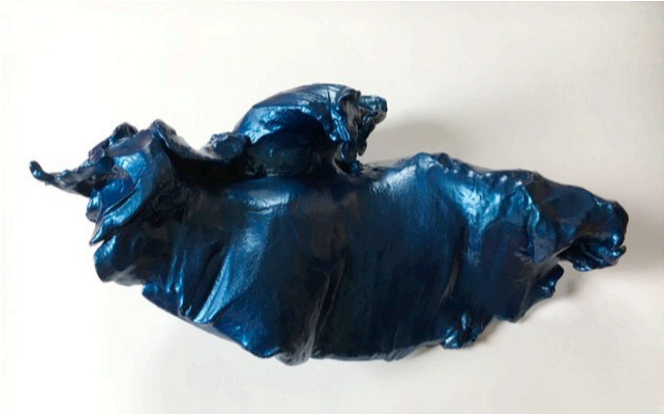
Spent Bullet [Toyota Blue 2004] , 2015/2016 ABS resin, six carat white gold 9 1/2 x 20 1/2 x 16 1/2 inches