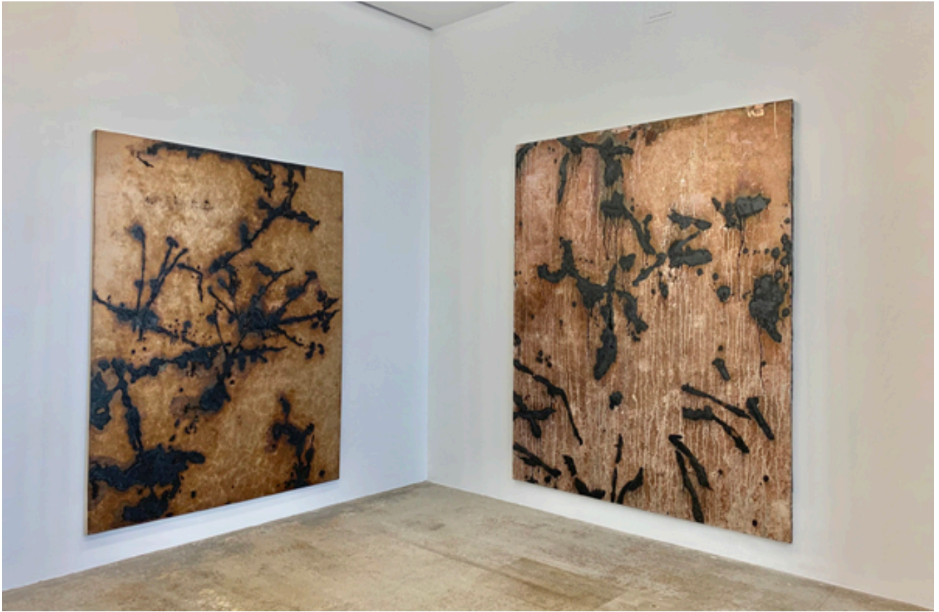
Contingency [Winter Light], 2011 Contingency [Snow Melt], 2015