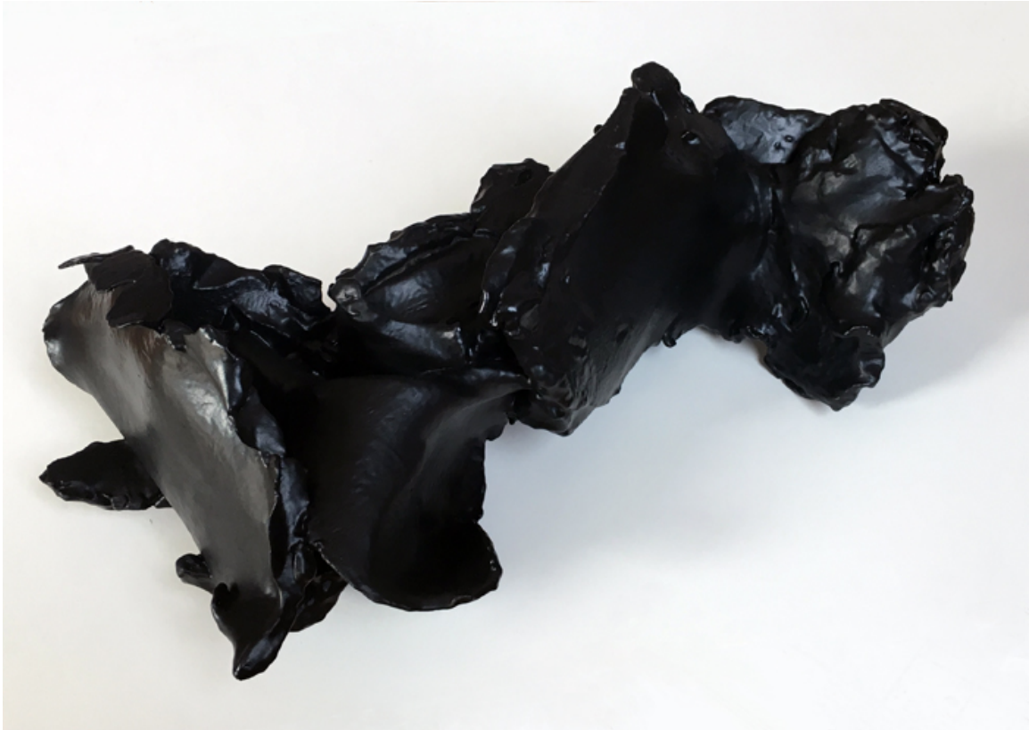
Spent Bullet [Dum Dum] , 2015/2016 ABS resin, rubber coating 8 x 26 ½ x 14 inches